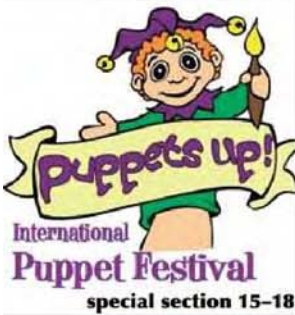
International Puppet Festival special section 15-18