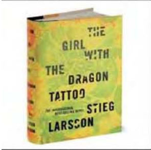
Summer Reading 14