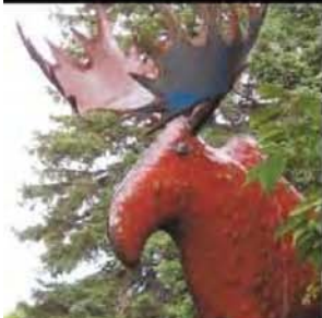
Hanging Around the Valley 13