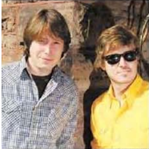
August's Events 24 & 25